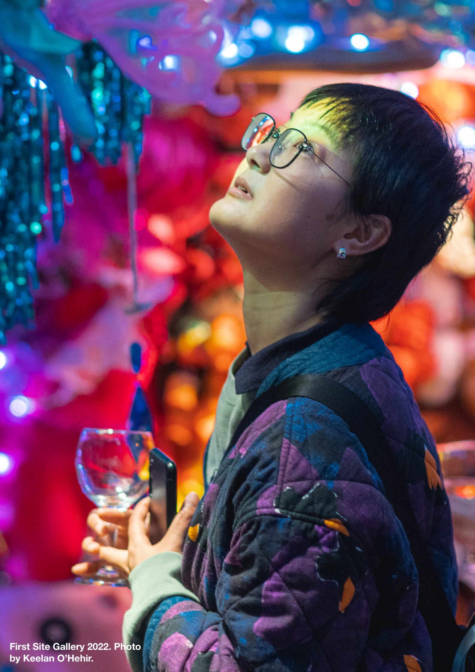
First Site Gallery 2022.