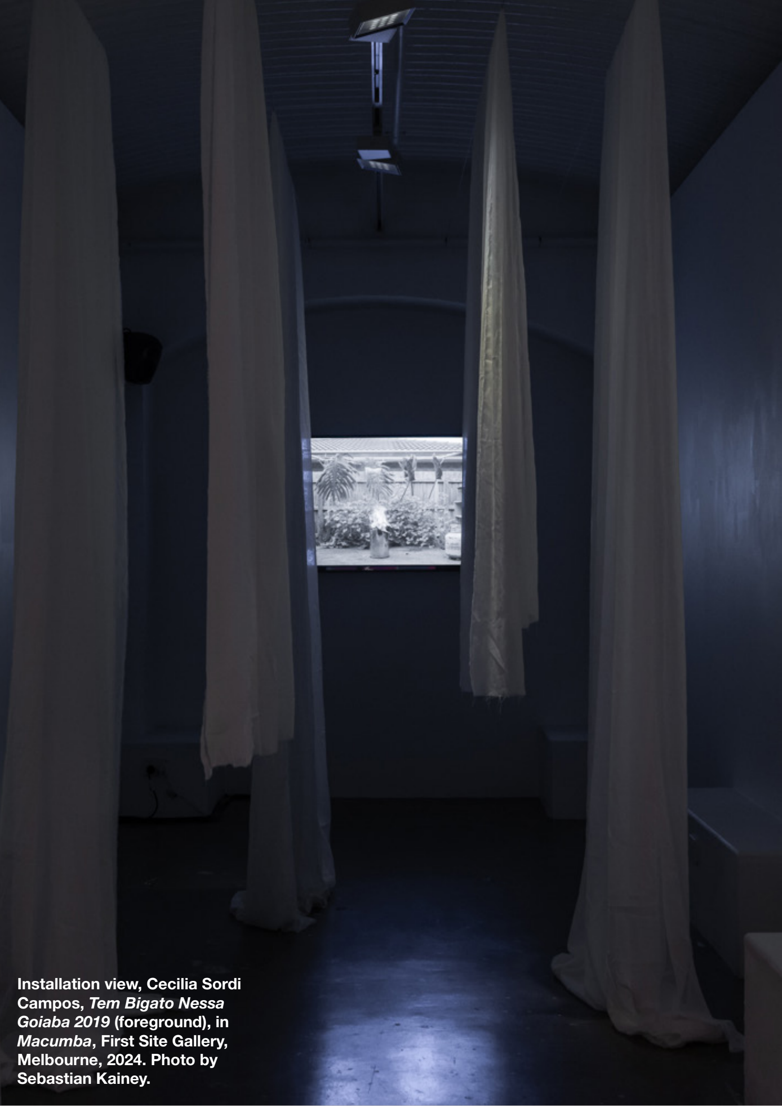
Installation view, Cecilia Sordi Campos, Tem Bigato Nessa Goiaba 2019 (foreground), in Macumba , First Site Gallery, Melbourne, 2024.