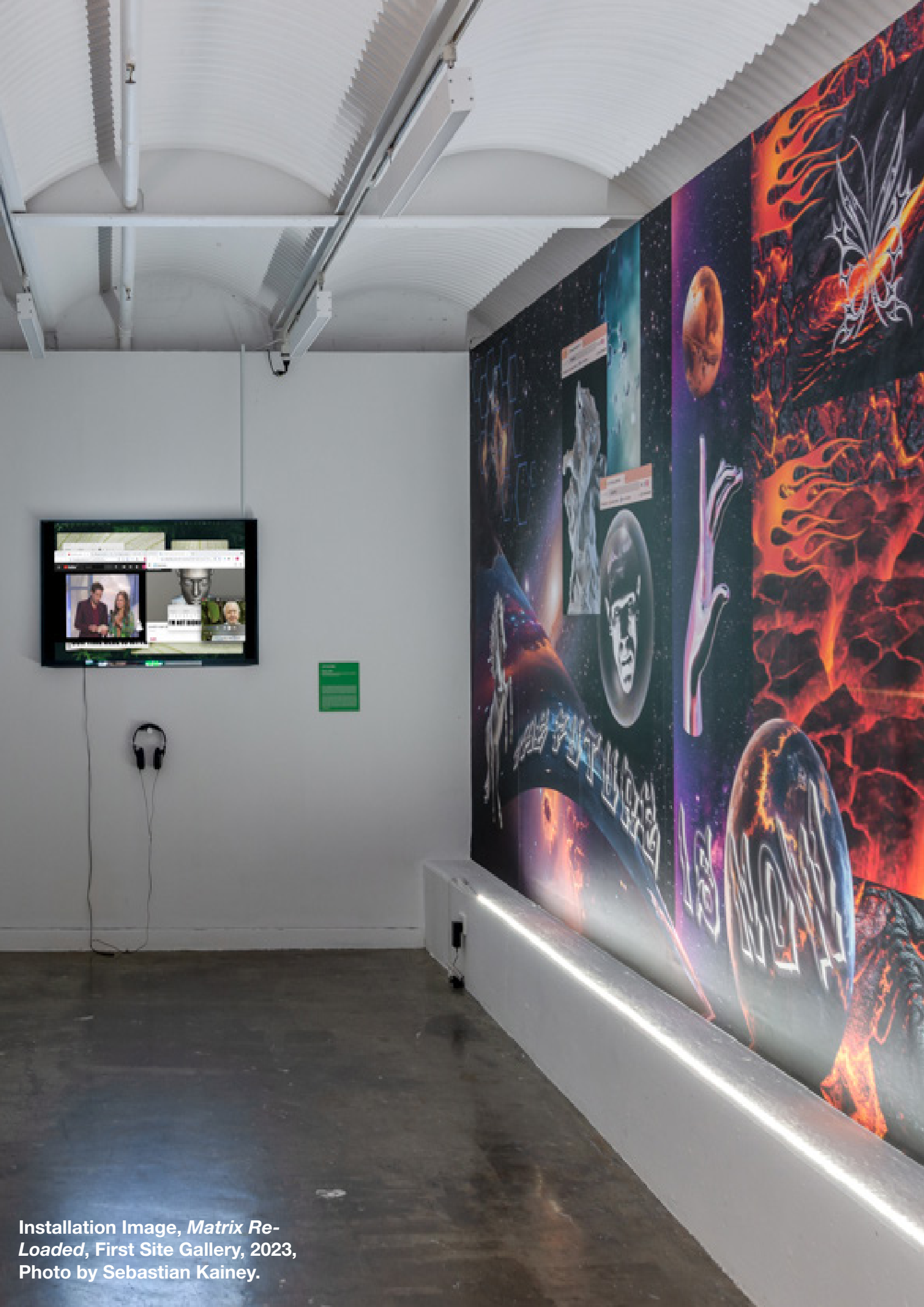
Installation Image, Matrix Re-Loaded , First Site Gallery, 2023, Photo by Sebastian Kainey.