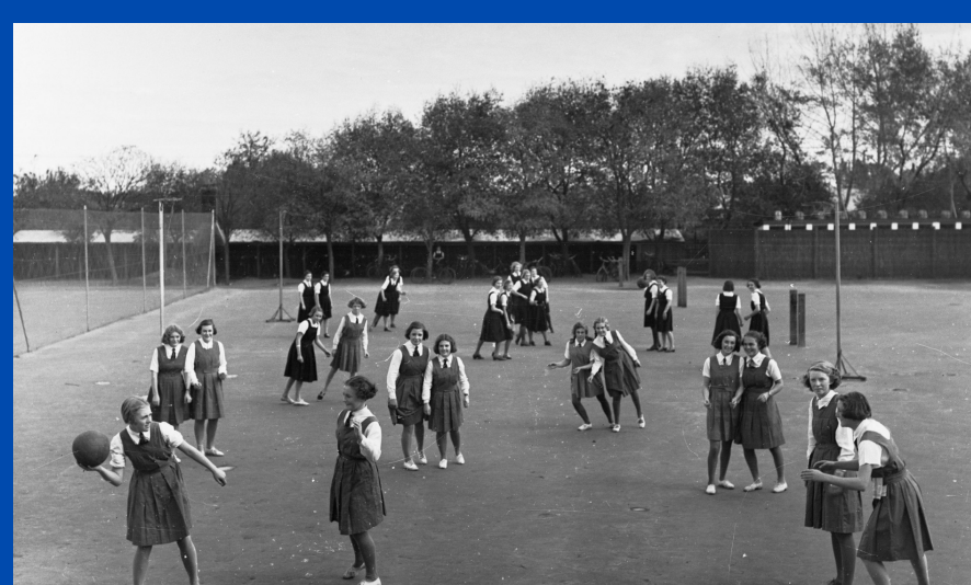
Historical analysis of femininity in netball