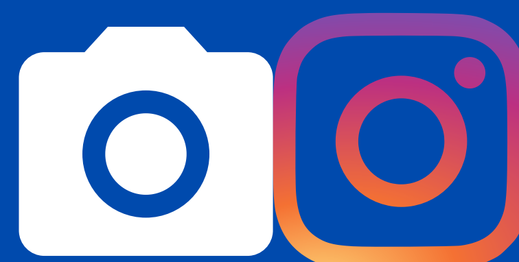
Media representation of netball