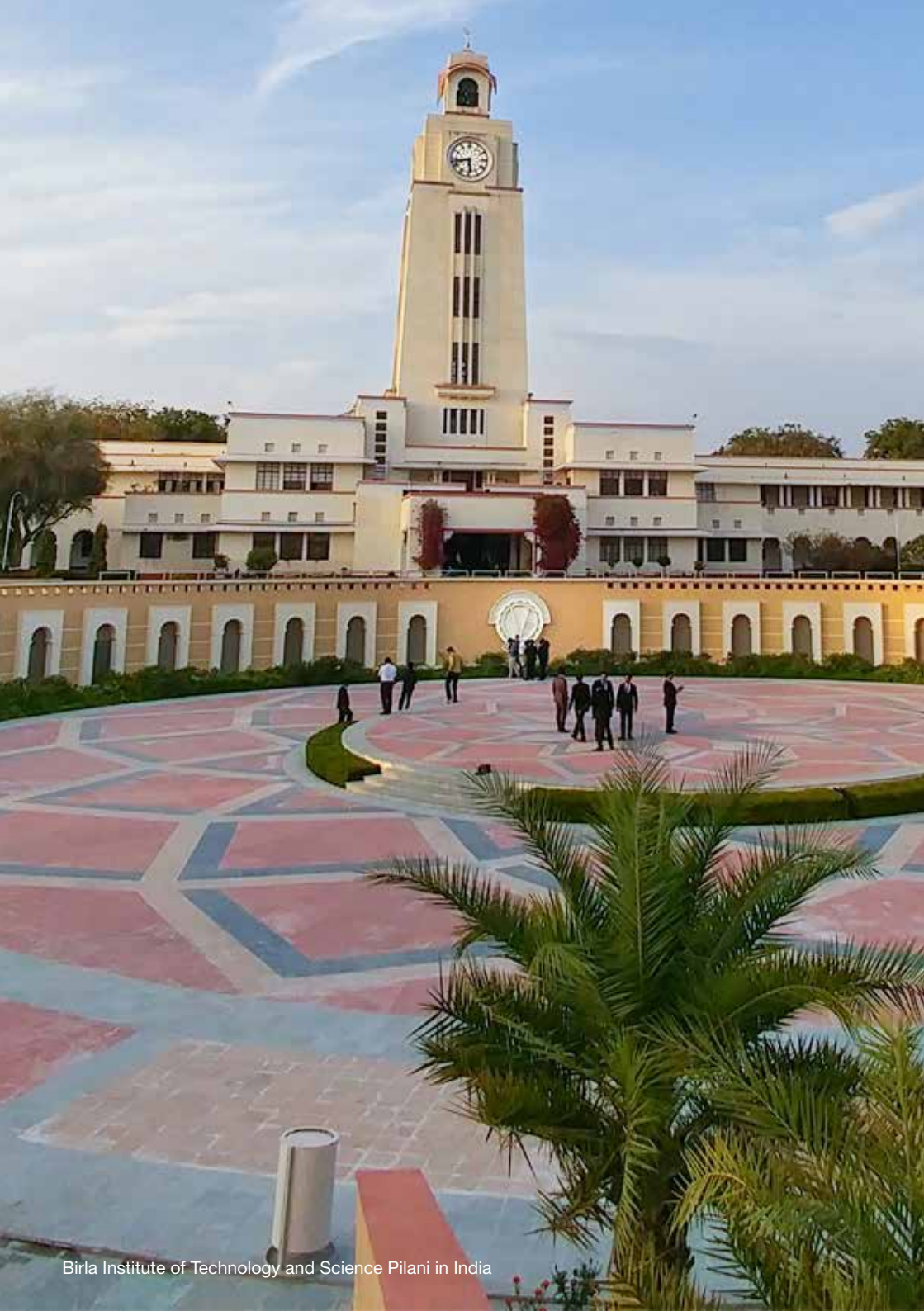
Birla Institute of Technology and Science Pilani in India