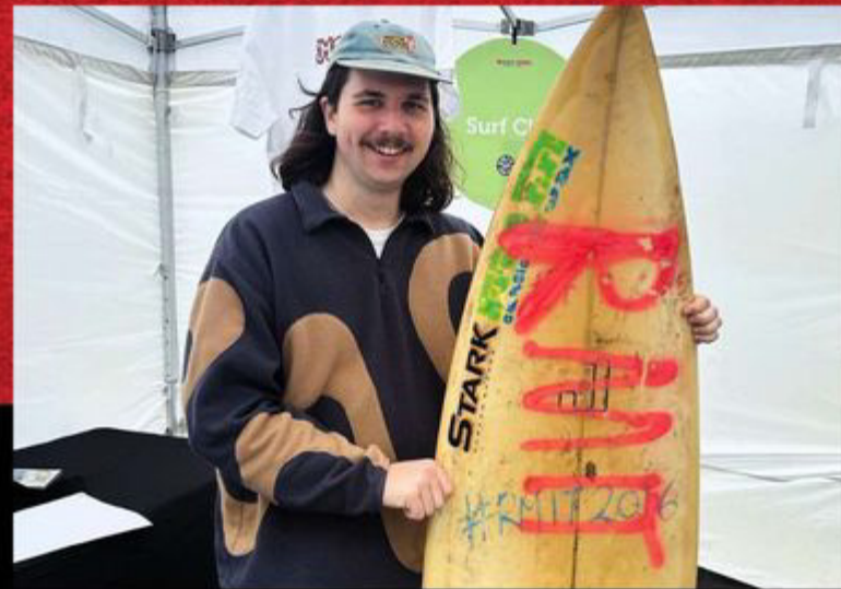
JAMES HENDERSON SURF CLUB