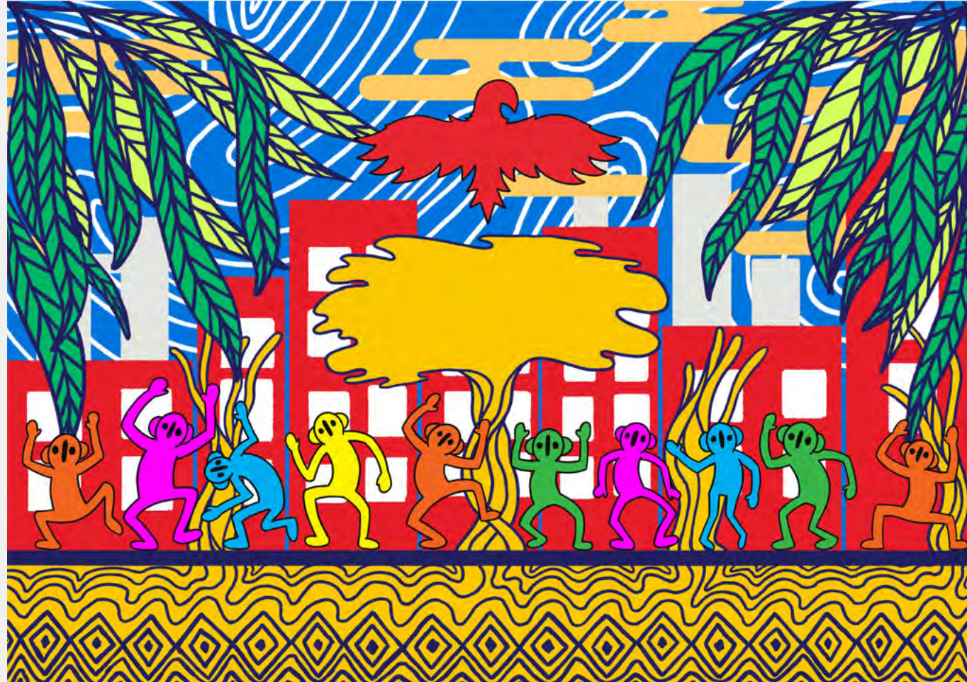
Artwork by: ENOKi (Dja Dja Wurrung/Yorta Yorta)

The imagery that can be found in this piece goes as follows: