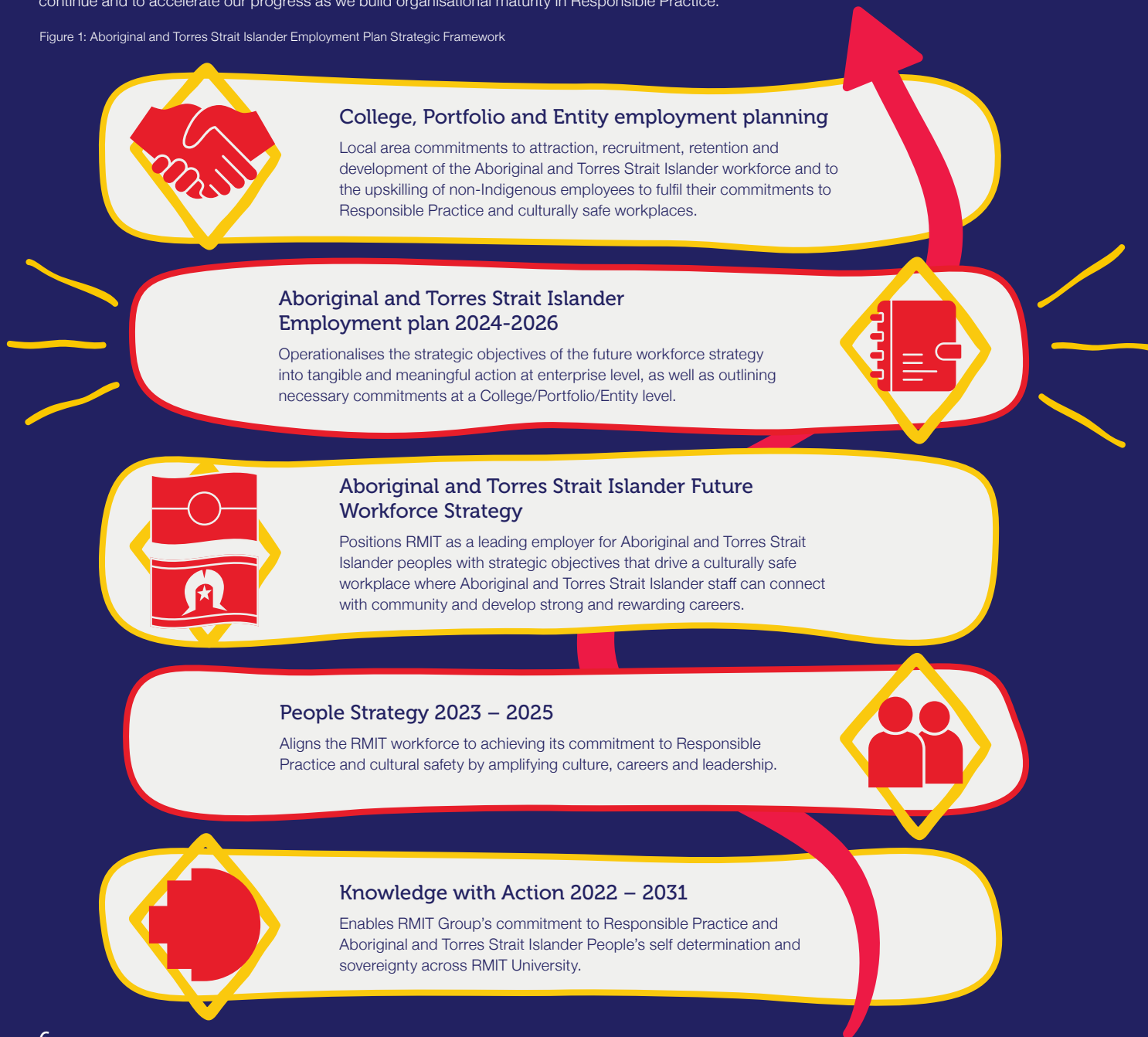
Figure 1: Aboriginal and Torres Strait Islander Employment Plan Strategic Framework

This plan continues the commitments made in Dhumbah Gooroowa and operationalises the existing Aboriginal and Torres Strait Islander Workforce Development Strategy while recognising the need to align actions with the commitment to Responsible Practice identified in the RMIT Knowledge with Action strategy. The plan aims to work within the strategic framework illustrated in Figure 1 to continue and to accelerate our progress as we build organisational maturity in Responsible Practice.