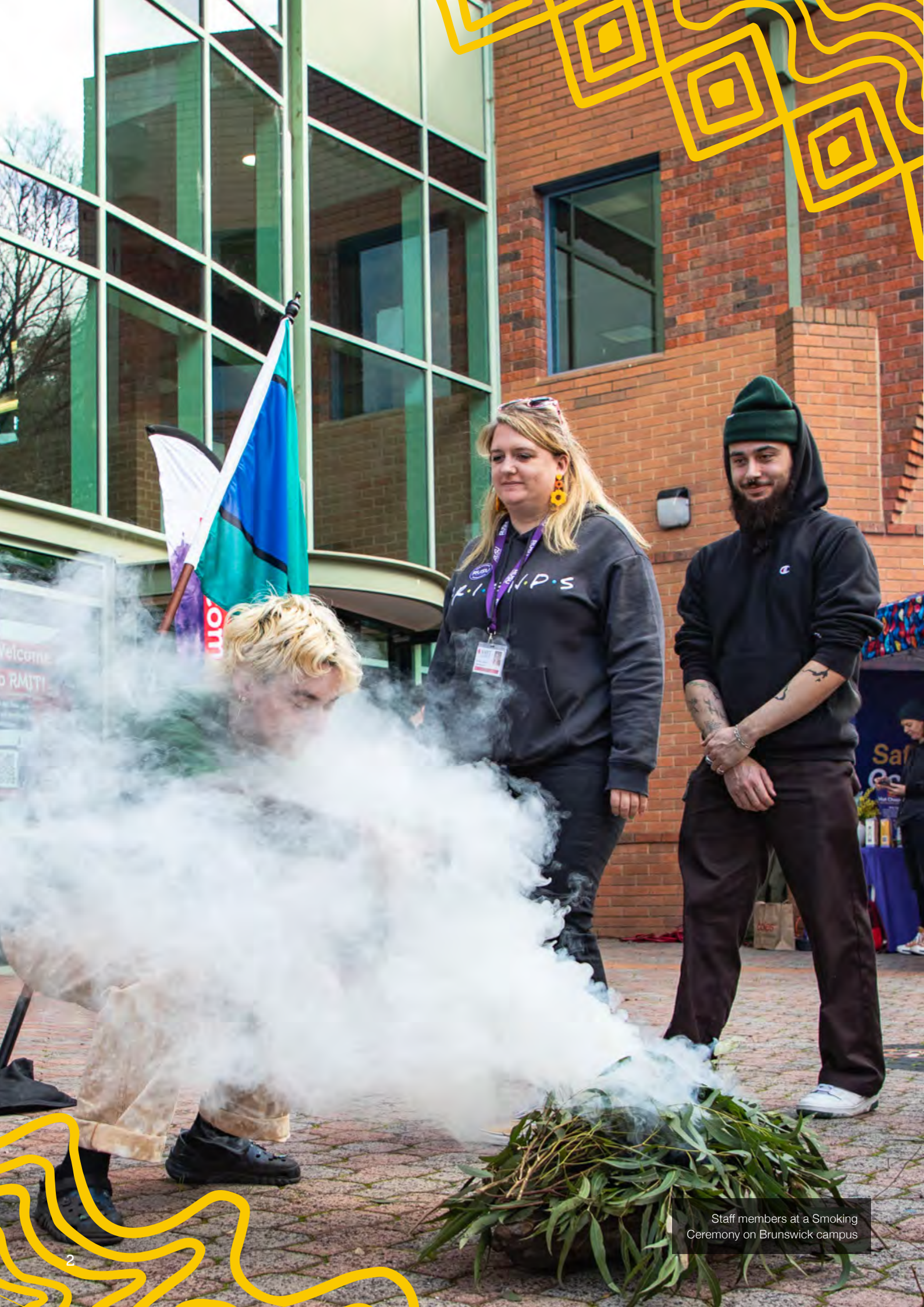
Staff members at a Smoking Ceremony on Brunswick campus