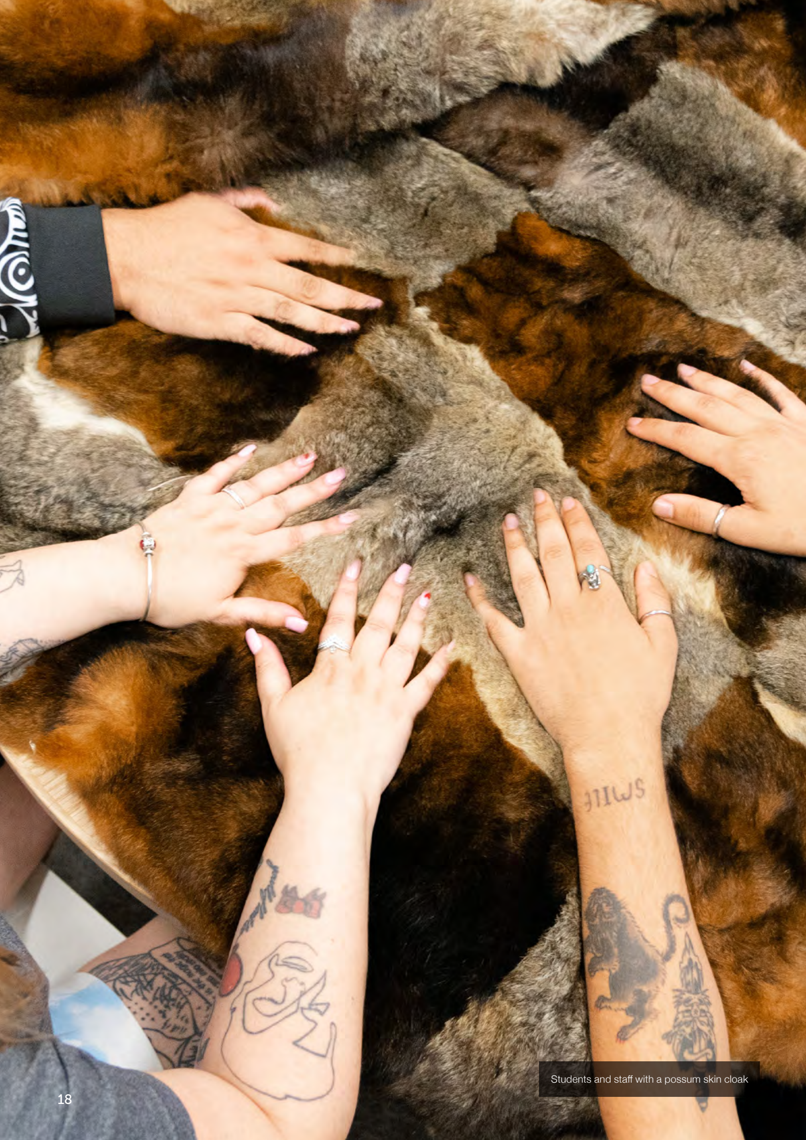
Students and staff with a possum skin cloak