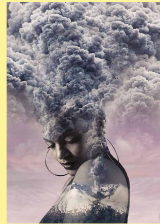
Photograph by Diploma of Photography and Photo Imaging 2017 graduate Michael Borzillo. Capture Magazine – Australia's Top Emerging Student Photographer of the Year 2018.

Society is progressively reliant on visual material. Photographers actively engage in producing and exchanging images that reflect the vibrant cultural dynamic of a contemporary society.