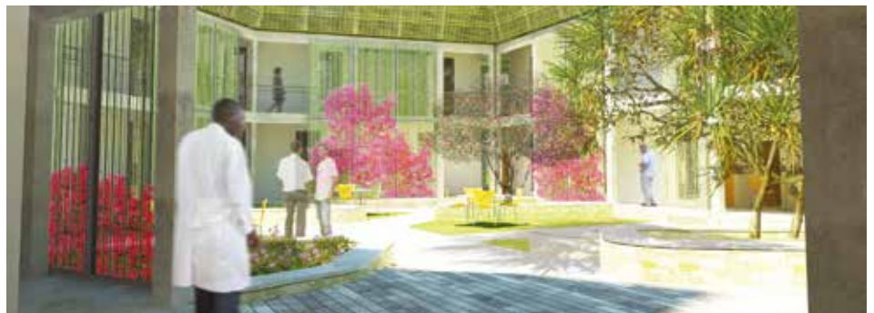
Gheskio Tuberculosis Hospital, Port au Prince