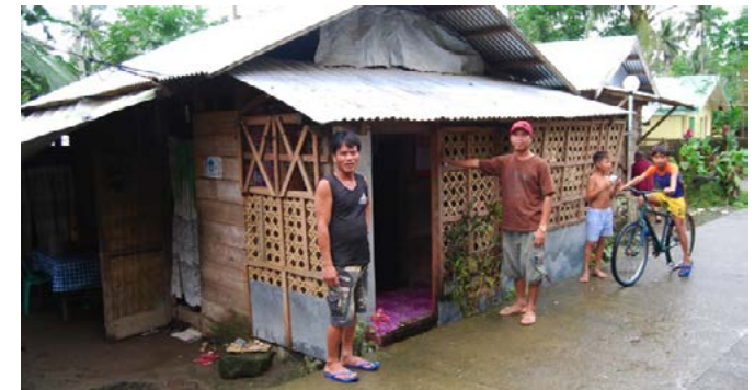
After Typhoon Haiyan, Philippines 2013