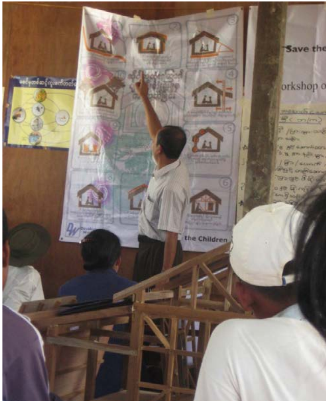
Capacity Building in Myanmar

“The spontaneous reconstruction of housing begins extremely rapidly after a disaster ... all action to discourage this process should be avoided”