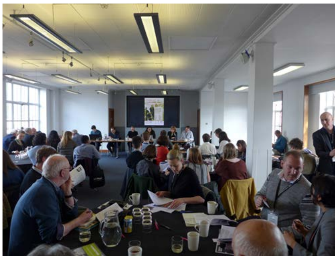
Impressions from the Creation and Catastrophe Symposium

The following recommendations were proposed at the meeting: