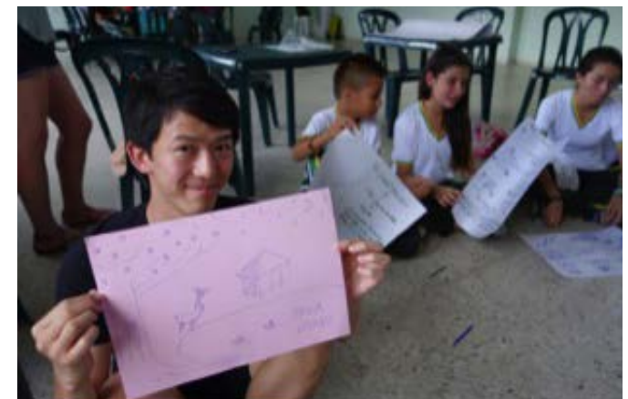
CENDEP's Degree Programs