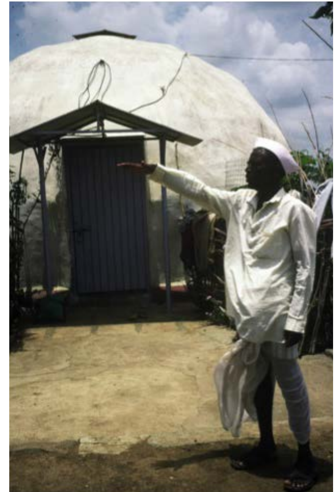
Permanent ferro-cement dwellings in Kilari after the 1993 Latur earthquake, India

It is important to create an environment where people have a direct stake in what is going on and can exercise some power and authority. Creativity is usually executed top down, an approach that is not very successful. Processes need to be organized bottom-up and compromises made where people are part of the system.