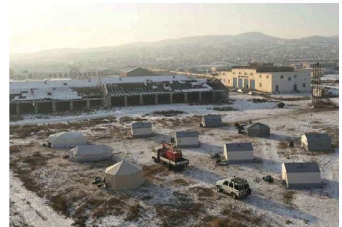
Winterisation of Tents for the Red Cross © Foster + Partners