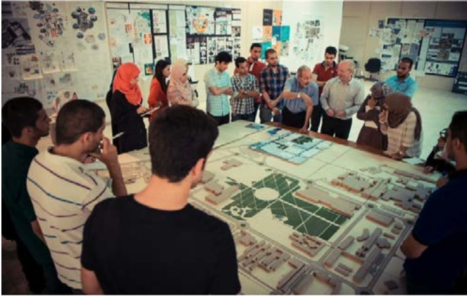
Building Capacity and Raising Standards