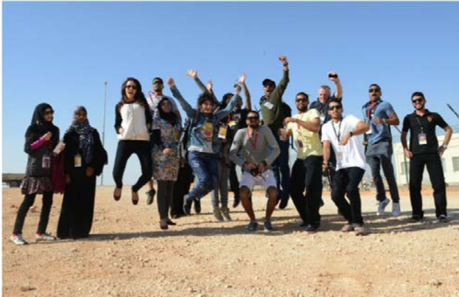
Promoting Engagement