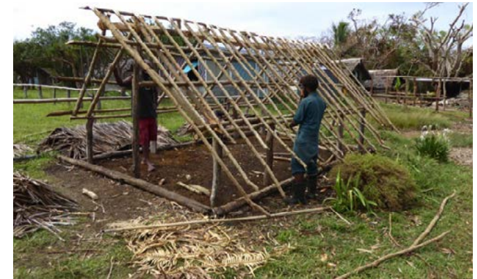
After Cyclone Pam, Vanuatu 2015