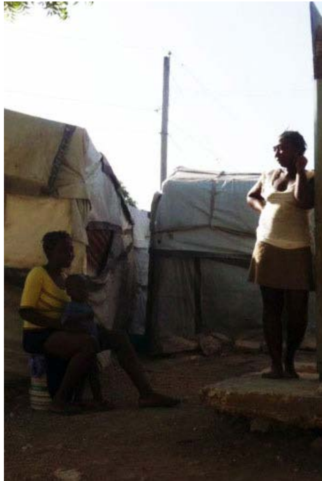
Temporary Housing in Haiti