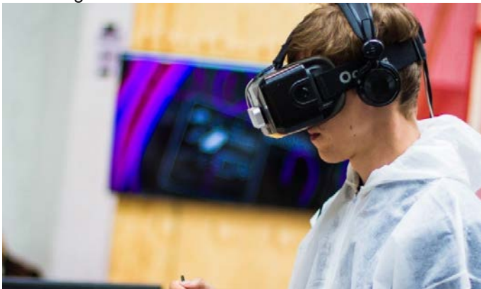
RMIT students immerse themselves in augmented reality technology.

Global augmented reality and virtual reality revenue are expected to hit $US150 billion by 2020 – transforming how we learn and how businesses operate. A focus on virtual reality and artificial intelligence will support growing demand and address skills gaps in these growing technological fields.