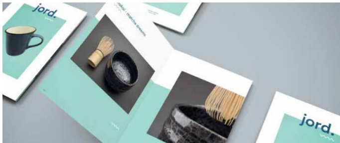
Student work showing digital design skills.